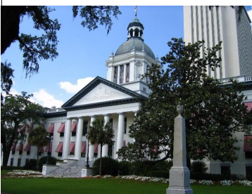
Florida's Old and New Capitols

Every ten years, Florida gets one chance to take a picture of your community. That snapshot determines ten years worth of investments in the future of your community. By visiting www.myfloridacensus.gov , you can help make sure that everyone in your community is represented in Florida's portrait.