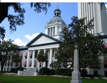
Florida's Old and New Capitols

Phone – (866) 857-7289 Fax – (888) 544-0393