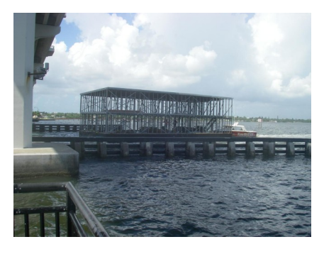
Barge passing under Jensen Beach Causeway being moved by Tow Boat US

On August 17th I received an email from constituents who reside on Indian River Drive in Ft. Pierce. The email was an inquiry regarding the status of a barge stuck on a sea grass bed on the Indian River. The email stated "we contacted EPA, DEP, FWC, Marine Patrol, Coast Guard, and every other governmental agency to no avail".