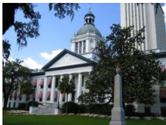
Florida's Old and New Capitols

Toll Free Numbers: Phone – (866) 857-7289 Fax – (888) 544-0393