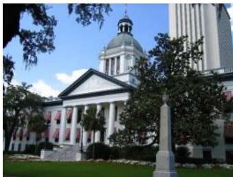
Florida's Old and New Capitols

Toll Free Numbers: Phone – (866) 857-7289 Fax – (888) 544-0393